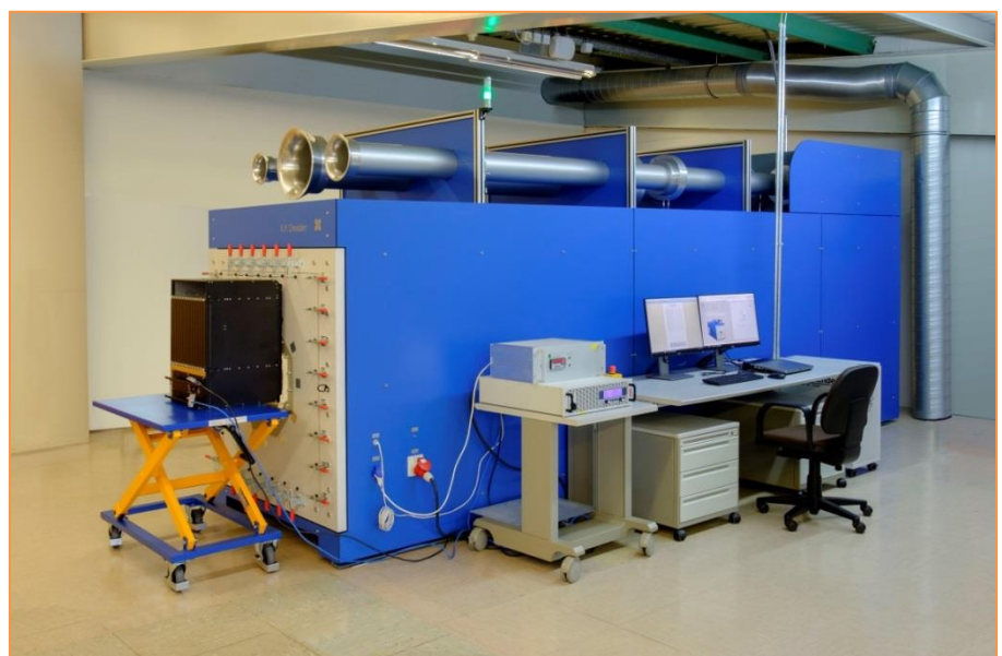
Figure 2 Air performance test rig_2