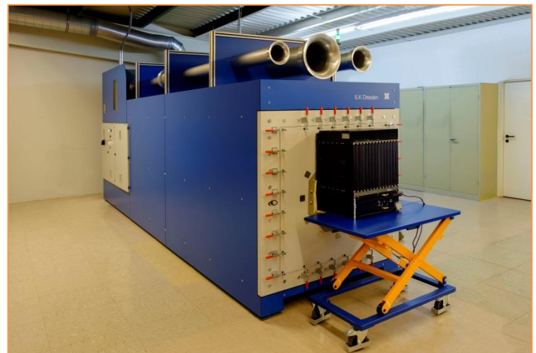
Figure 1 Air performance test rig_1