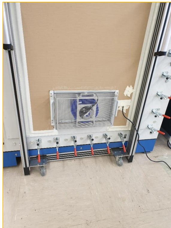
Figure 4 Measurement setup_2