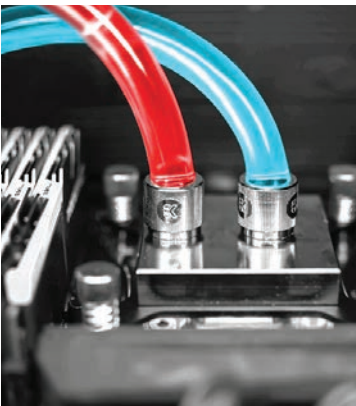
Cold Plate (Chip Level Cooling)