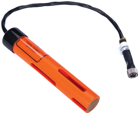
Figure 5. Example Fast Fuel Sensor

Emergency generators are currently used in the majority of data centers for backup power. Leaks from generators or their fuel tanks are not only a significant fire safety hazard but a significant threat to business continuity. Many of these generators are located in basements or below ground where water or moisture may be present. A specialty probe for quickly identifying a fuel leak is shown in Figure 5. This probe is designed to ignore water but identify fuel leaks including films floating on top of water. Such detectors comply with performance standards outlined in Factory Mutual Standard FM 7745.