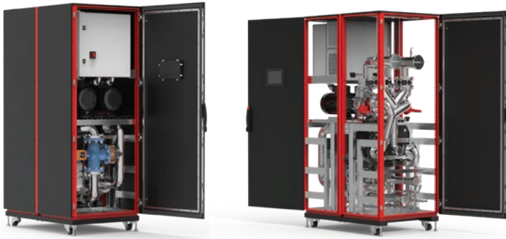
Coolant Distribution Unit (CDU)

Index Terms – Leak Detection, Data Centers, nVent RAYCHEM TraceTek