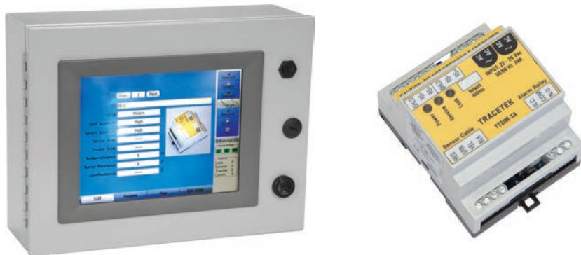
Figure 9. Locating Alarm Modules

Other module types include modules that connect multiple cables, probes and other sensors and include detection and full location capabilities. A wide variety of user interfaces are also available. In most cases, these modules are connected to Building Management Systems (BMS) or similar instrumentation or security monitoring systems. Many of these modules can be programmed to take immediate action such as shutting off power or turning off a liquid flow valve to minimize damage and safety hazards.