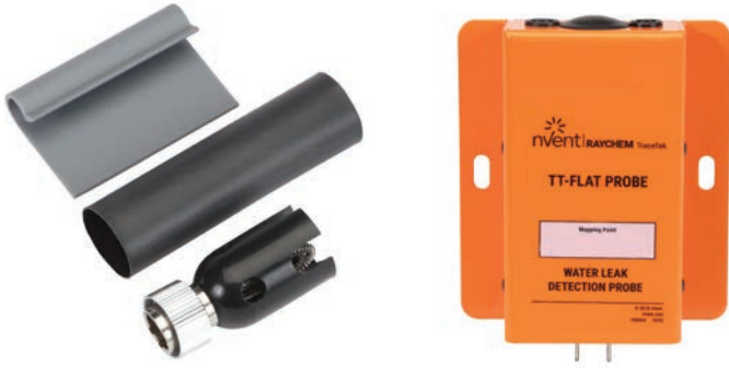
Figure 4. Example Point Contact Probes

Leak sensors are available in a wide variety of shapes and sizes. The simplest type include probe or point sensors. When used to detect conductive fluids such as water, acid, or caustic, the probes consist of two-point contacts which send a signal when the conductive fluid touches both points at the same time.