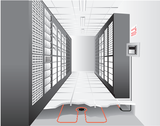
Figure 7. Example Leak Detection Cable Under Raised Floor

A unique feature of some cable sensors is the ability of not only identifying that a leak occurred, but to accurately determine where along the cable the leak occurred. For example, when used under a raised floor or within a server rack as illustrated in Figure 7, a leak touching one portion of the cable would trigger the monitoring electronics to identify which specific floor tile or rack position to investigate.