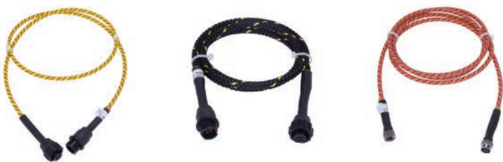
Figure 6. Example Cable Sensors

Again, cable sensors come in a variety of types for different applications such as detecting water, acids, caustic, and other aqueous chemicals. Figure 6 includes examples of cable sensors.