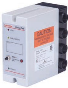
Figure 8. Non-locating Single Alarm Module

Leak detection sensors can be connected to numerous types of monitoring devices. The simplest monitor connects to a single probe or cable and provides an alarm as soon as it detects a leak. These types of modules do not locate the leak but usually include a switching relay for on/off control of a pump or valve to stop the leak.