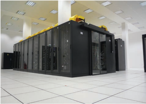
Figure 1. Typical Data Center

Although they are rarely seen or thought of by the average individual, data centers are critical to nearly every aspect of our day to day existence.