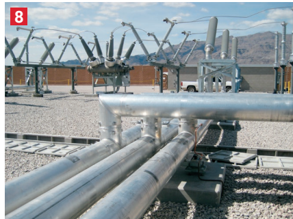
1 Transmission Line Crossings