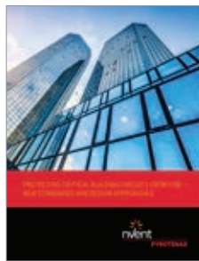
Construction Methods White Paper (H60239)