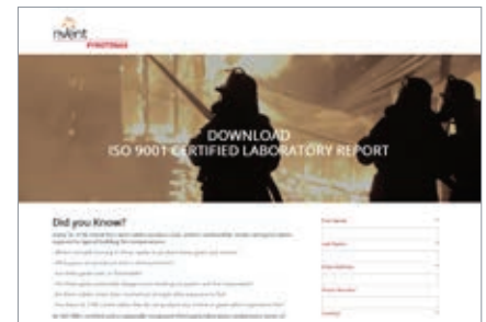
Beyond UL 2196 Landing Page