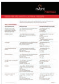
Codes for Life Safety Electrical Circuits (H57618)