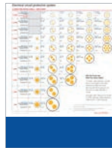
System 1850 MI Size Chart (H58874)