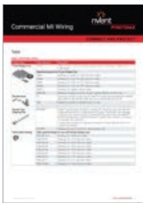
Commercial MI Wiring Tools Data Sheet (H57603)