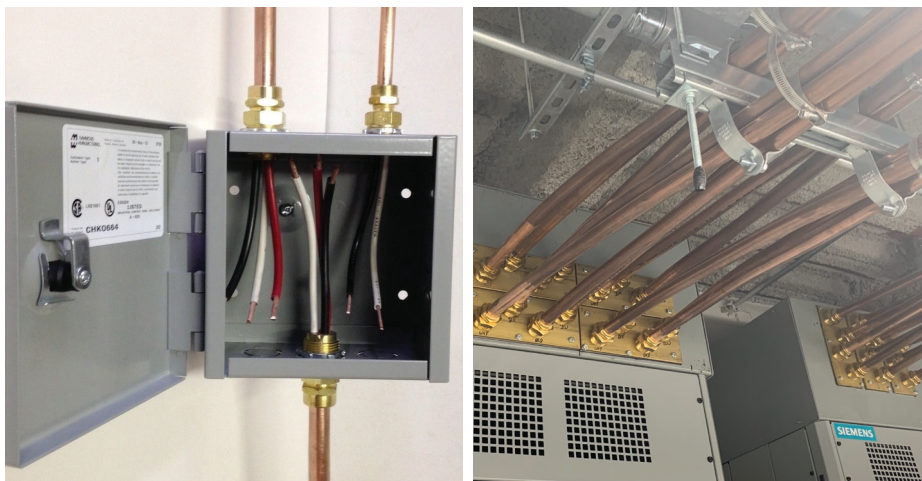
Completed MI cable terminations