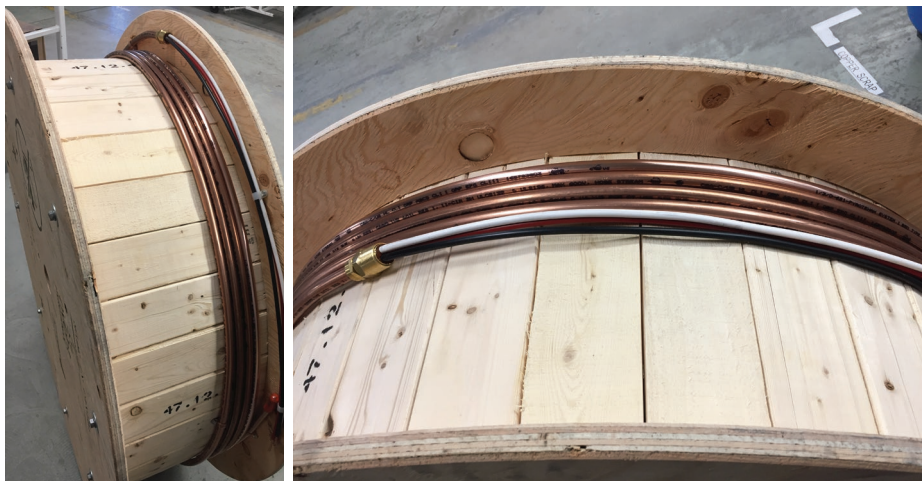
Pre-terminated 6/3 multi conductor MI cable